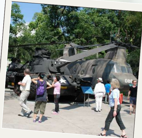
War Remnants Museum